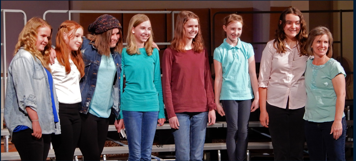
Get Your Kicks on Route 66!

The Durango Children's Chorale wrapped up the Spring 2022 season on Tuesday April 26, with a delightful concert for parents and community members. The selections for this concert were primarily American pieces, including lyrics by Robert Frost; a fun 2-part song about a day at the races; and a based-on-a-true-story song about the Rock Island Line, a "northbound train on a southbound track... he might leave but he won't be back." The fun rhythm, 2-part harmony and lyrics actually belie the tragic tale, and the song was a true audience pleaser!